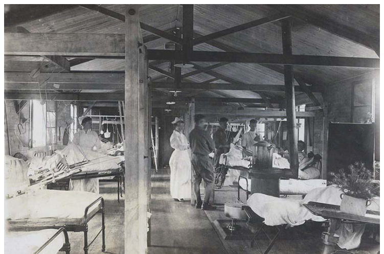
Interior (ward) of No 12 General Hospital

At the outbreak of the First World War in 1914 there were just under 300 regular members of the Q.A.I.M.N.S; due mainly to its (antiquated and) strict entrance rules, potential candidates had to be single, aged over 25 years old and of a high social status.