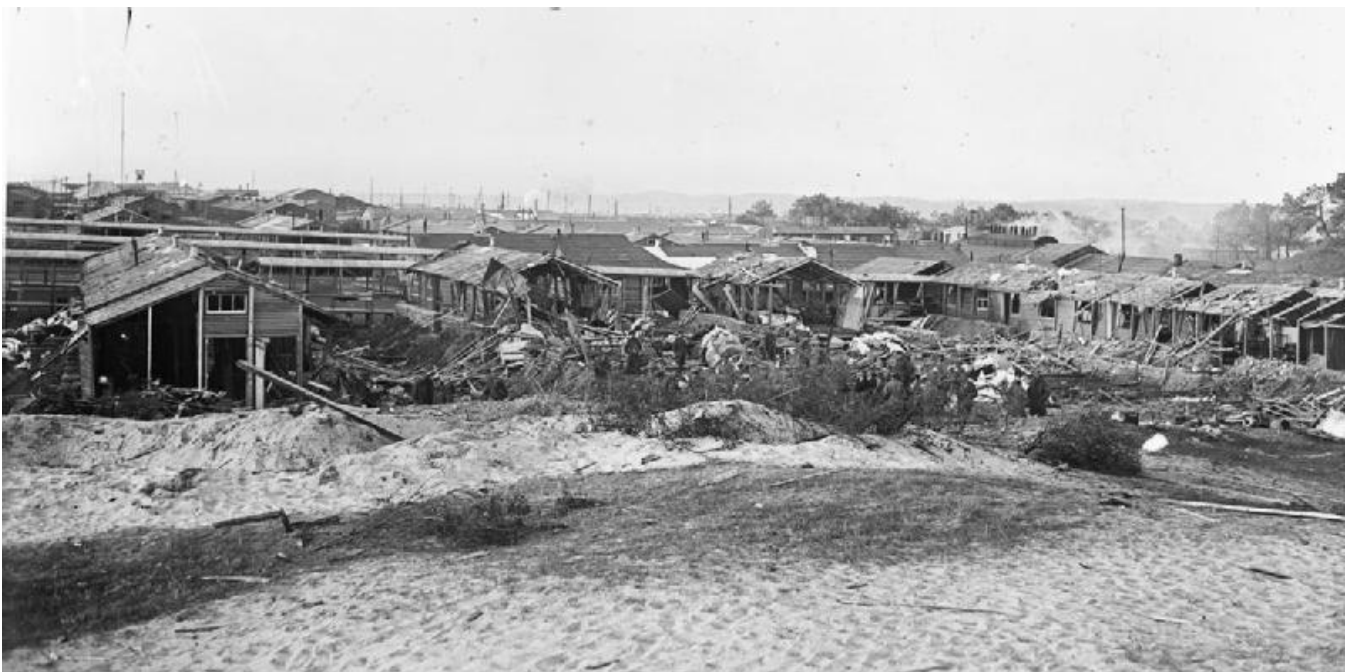
St. John Ambulance Hospital after the raid of the 31 st of May 1918 on Etaples

A raid on the 31 st of May destroyed the St. John Hospital with serious loss of life and a month later on the 29 th of June No 51 General Hospital was hit.