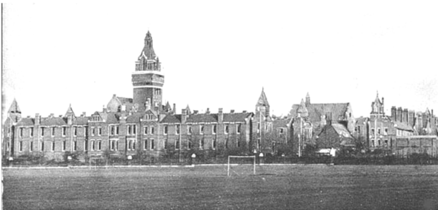
St. Marylebone Infirmary